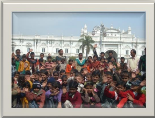
16-17 Feb. 2012 --Child Exposure Tour