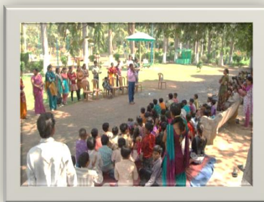
17 March- Bal Mela