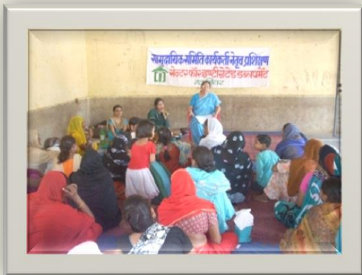
27-28Feb, 29-30 June-- Community committee Training