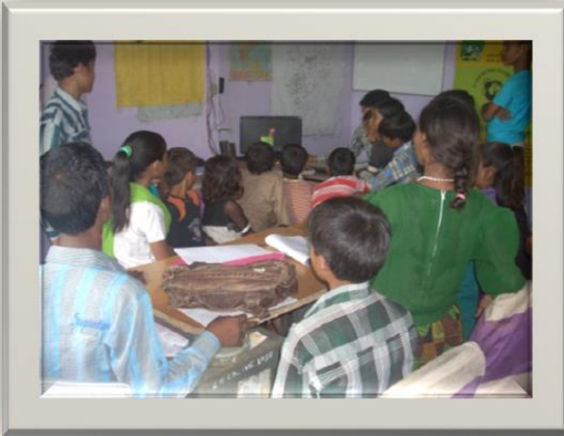
Computer Education by CRRC