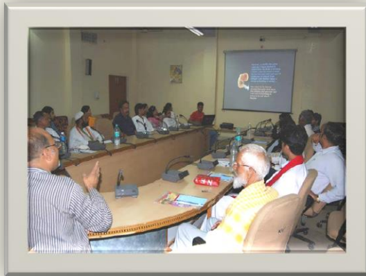
Orientation Programme with representative of various religion