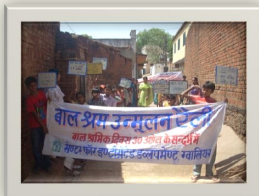
30 April- The Anti-Child Labour Day