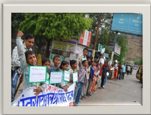
12 JUNE –World Day against child labor