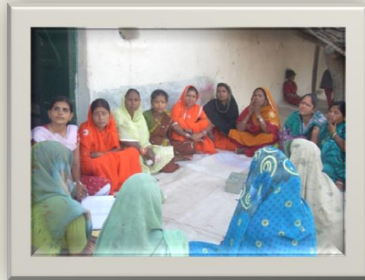
28-29 March 2012—SHG Exposure Tour