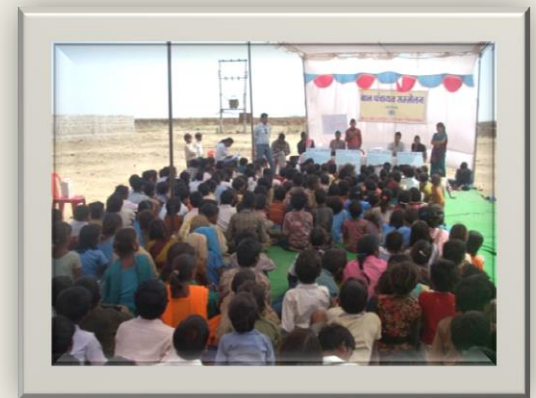
Bal Panchayat Convention at Agra (Sheopur)