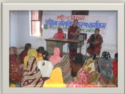
8 March-International Women Day

CID is rendering its services apart of limitation of our projects. CID is trying to sustain developmental progress on various sort of social issues. This year CID initiated many activities for multiple progress among community of Gwalior and rest of our field.