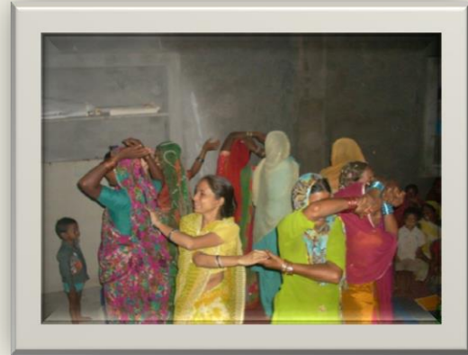
Women celebrating during an programme on Women empowerment