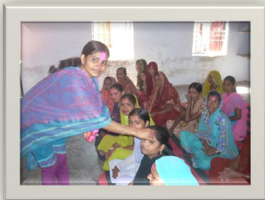
Holi festival celebration