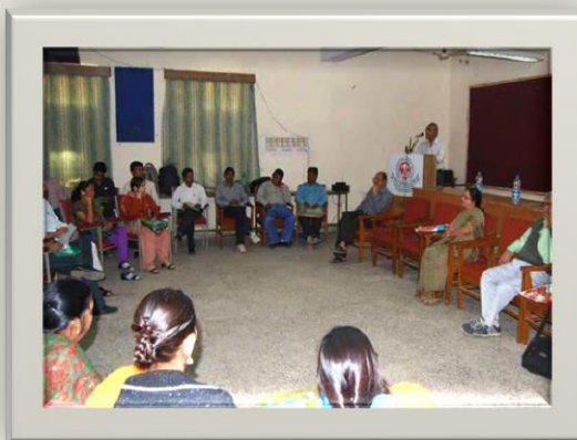
10 Feb--Networking meeting on Child Labour