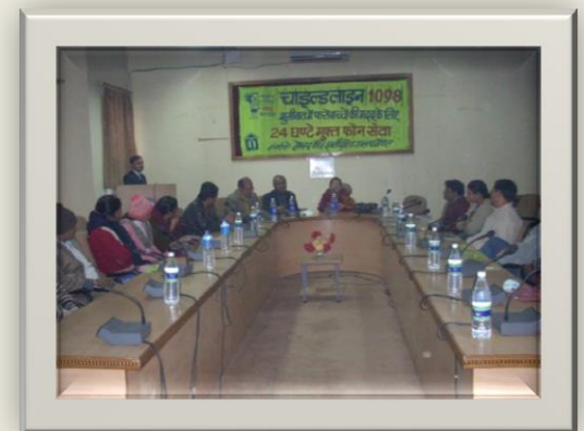
Orientation on Child-line