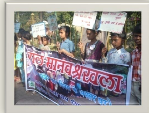
Human chain on Children's Day