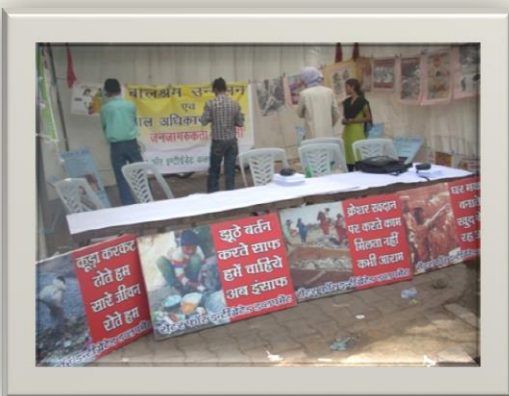
Exhibition on Child Rights