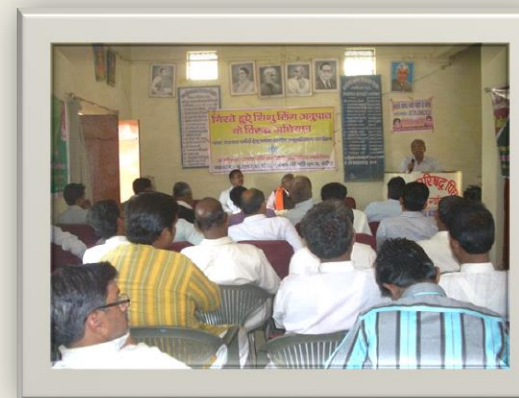
Orientation Programme with member of Municipal Council.