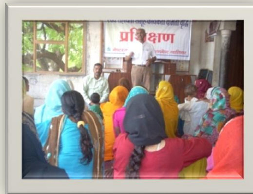
29-30 May-- SHG Training