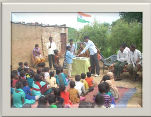
15 August—Independence Day celebration at Billoau